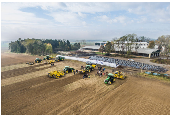
Presentation of BEDNAR machines by the ZD Bernartice premises in Jestřebice

After that TERRALAND machines started working: in particular, the TERRALAND TN 3000 in aggregation with a John Deere 8360 R and a TERRALAND TO 5000 with John Deere 9470 R. The chisel ploughs performed intense deep soil cultivation. Together with TERRALAND machines, a FENIX FN 3000 with FERTI-BOX FB 2000 F in aggregation with John Deere 8310 R were also presented. The set demonstrated supply fertilisation directly into the soil profile.