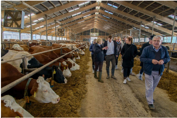
The Chairman of ZD Bernartice gave the journalists a tour of the agricultural premises in Jestřebice