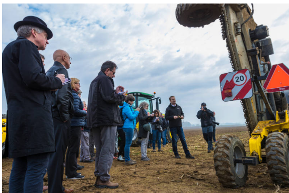
MULCHER MM 7000 was one of the machines that BEDNAR presented to the international journalists

The executive members of IFAJ who visited the Czech Republic were from the following countries: Argentina, Austria, Belgium, Canada, Czech Republic, Denmark, Finland, Ireland, Israel, Italy, Netherlands, Norway, Slovenia, South Africa, Sweden, Turkey, Ukraine and USA. The executive members from other countries excused themselves from participation.