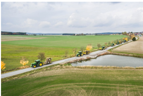
Transporting BEDNAR agricultural technology on roads in aggregation with John Deere tractors

During the busy programme of the IFAJ executive meeting in České Budějovice in October, international journalists looked at six BEDNAR machines for precise agriculture. The machines were introduced in the fields of the Bernartice Agricultural Cooperative in Jestřebice.