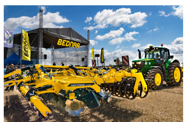
SWIFTERDISC XO 6000 F with a front cutting roller