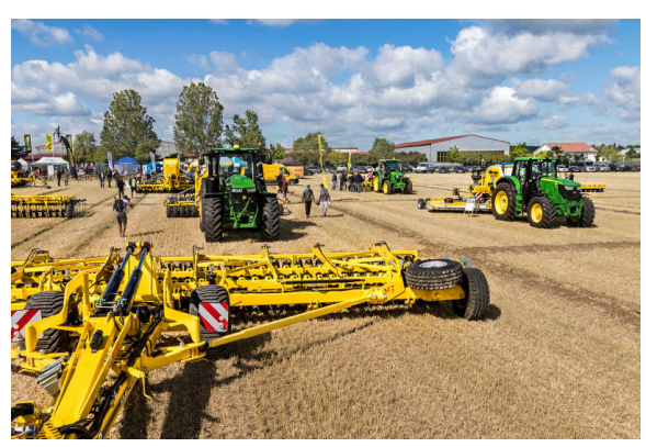
Facilities at 2017 BEDNAR Field Day near Městec Králové, visited by 2,098 people