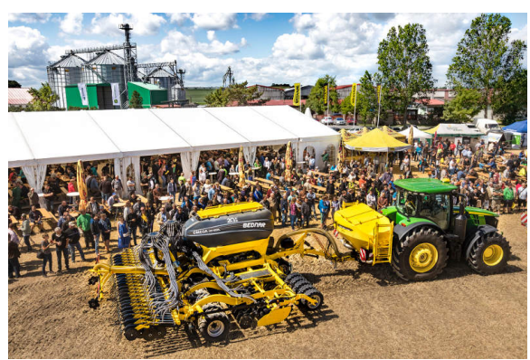
The new generation of the OMEGA OO L seed drill