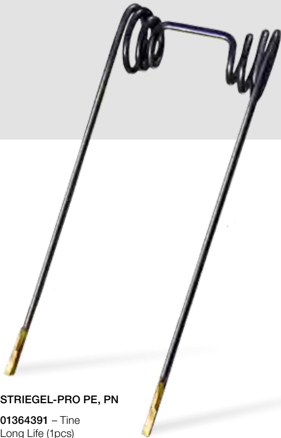
STRIEGEL-PRO PE, PN