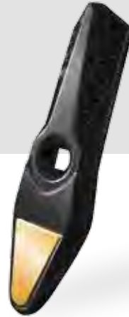
SWIFTER SN, SO, SE, SM