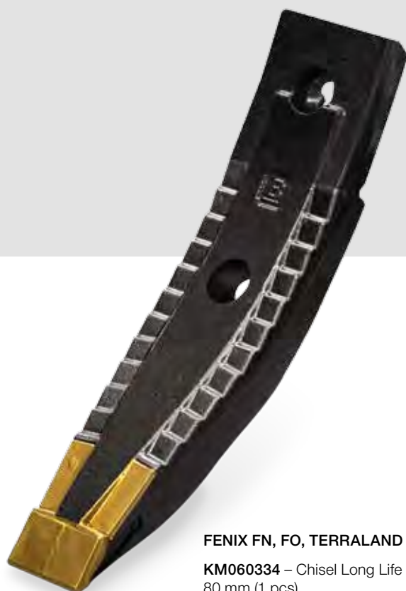
FENIX FN, FO, TERRALAND DO

KM060334 – Chisel Long Life 80 mm (1 pcs)